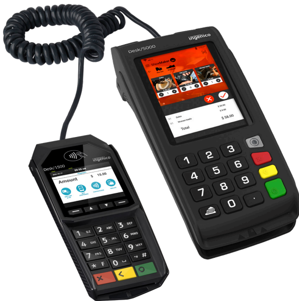
The Desk/1500 is supported by our Cloud Services